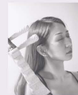
琵琶 Pipa 邵珮儀 Belle Shiu*