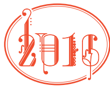
主題標誌設計：張欣蕊 Logo Design: Zhang Xinrui