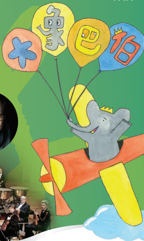
大象巴巴插畫：范雲曦 Babar Illustration: Airla Fan